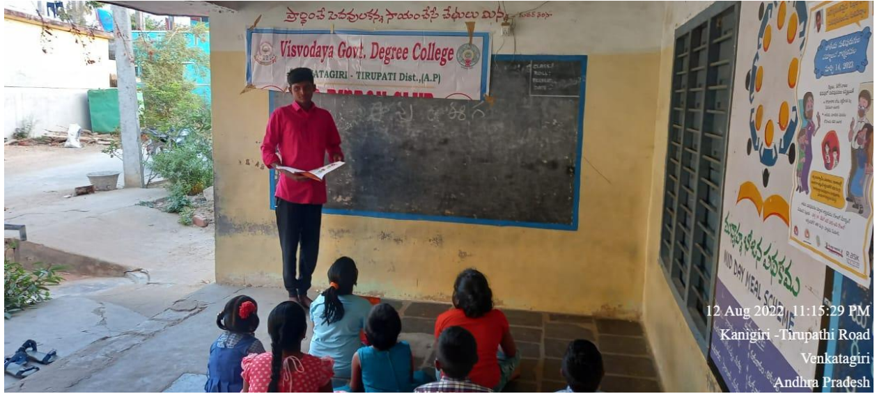
12 Aug 2022 11:15:29 PM Kanigiri - Tirupathi Road Venkatagiri Andhra Pradesh