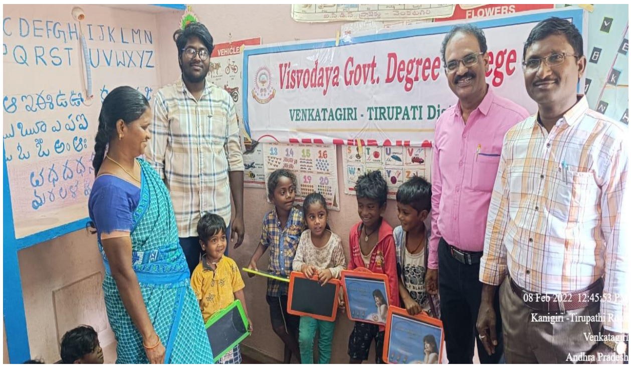
08 Feb 2022 12:45:53 PM Kanigiri - Tirupathi Road Venkatagiri Andhra Pradesh