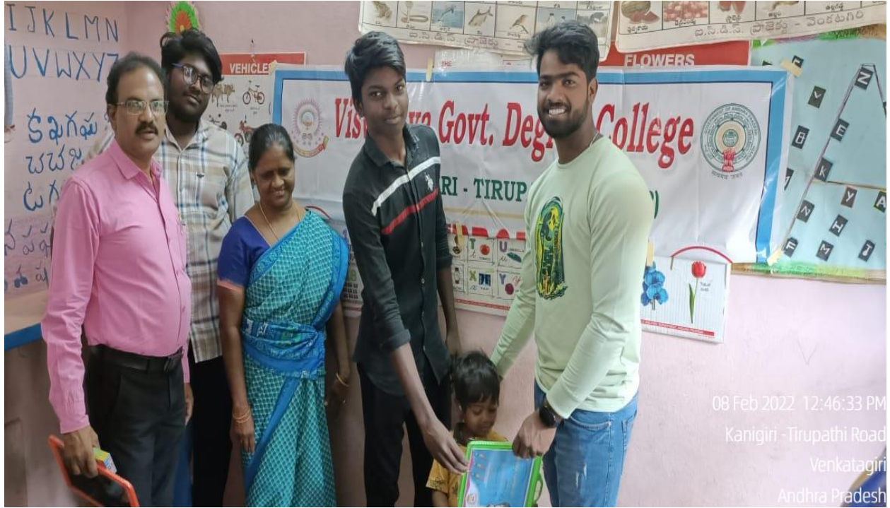
08 Feb 2022 12:46:33 PM Kanigiri - Tirupathi Road Venkatagiri Andhra Pradesh