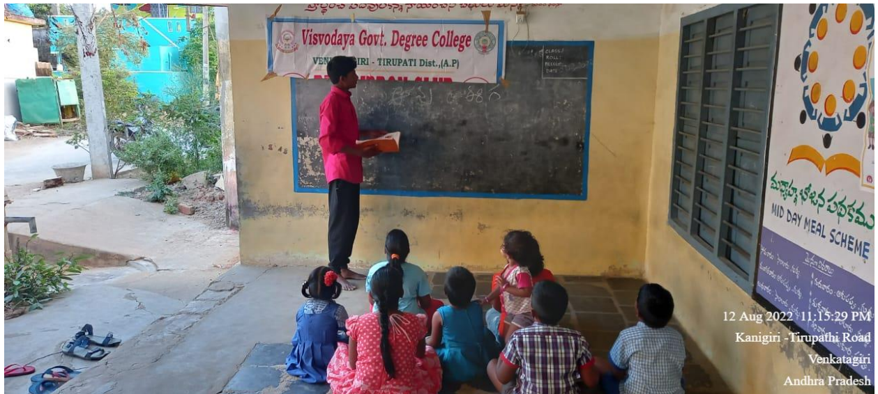
12 Aug 2022 11:15:29 PM Kanigiri - Tirupathi Road Venkatagiri Andhra Pradesh